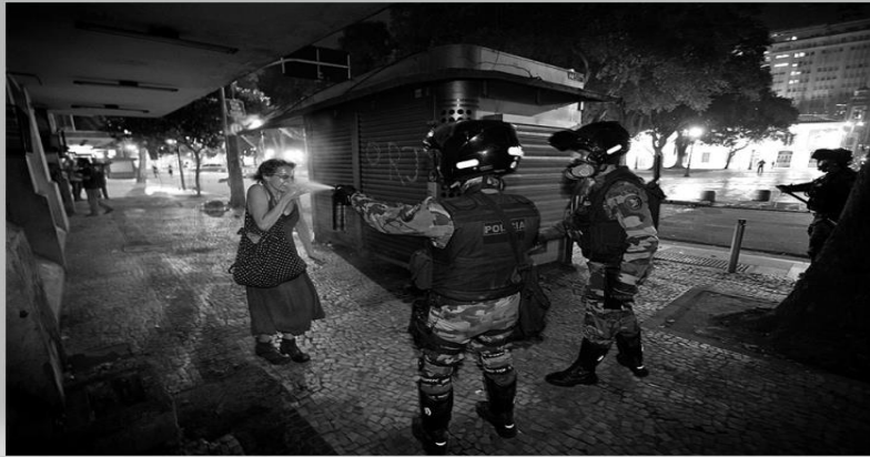
Figure. Military police apply pepper spray during protests in June 2013, Sao Paulo/SP/Brazil Image taken from the reference (11).